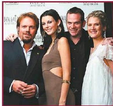
ALEXANDRE DE BRABANT