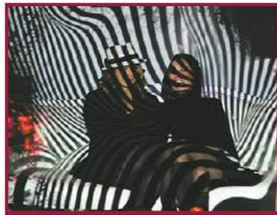
ALEXANDRE DE BRABANT